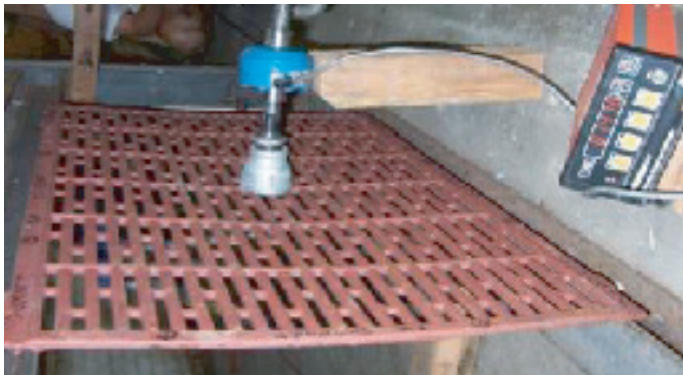
SCHONLAU INTIAL SET UP