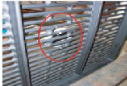
DURA-TUFF FLAT CAST, 1804 LBF: FAILURE