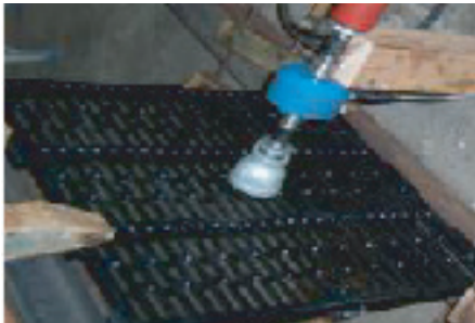
DURA-TUFF INTIAL SET UP

Grating samples were mounted on parallel I-beam per instructions and identically tested for flexural strength. A three inch (OD) diameter foot was used for the load application. Test equipment used was: Hydraulic Ram (RT: 0.5"/minute) Masstron M100, SN: 1189 with a 5K Load Cell, SN: 22641; Cal. Due date of 01/03.