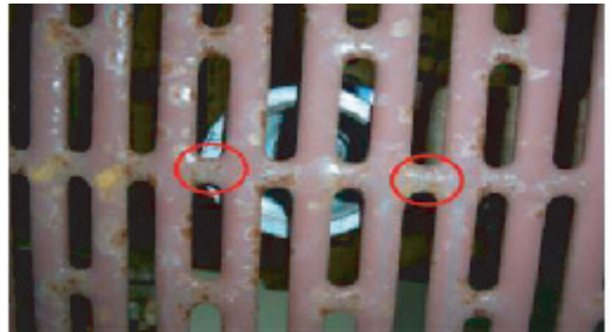
SCHONLAU (GERMAN CAST), 1594 LBF: FAILURE