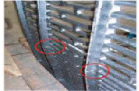
DURA-TUFF RAISED CAST, 2307 LBF: FAILURE