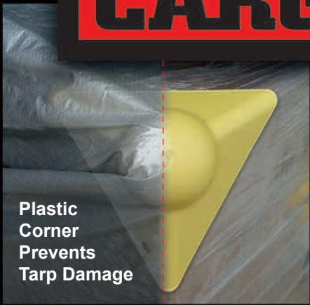
Plastic Corner Prevents Tarp Damage